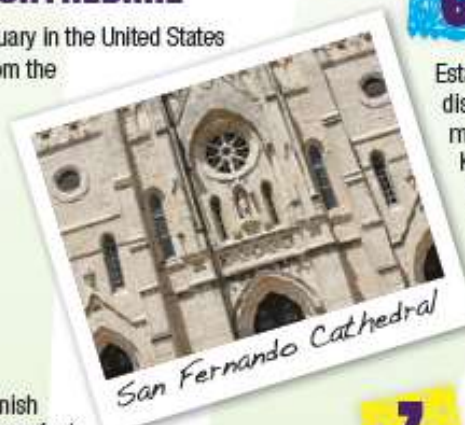
San Fernando Cathedral

Established in the 1840's this 25 block historic district was originally settled by prominent German merchants. Stroll down King William street, named Kaiser Wilhelm I of Prussia, and marvel at the homes nestled along the banks of the San Antonio Steves Homestead and the Carl H. Guenther both museums and available for touring.